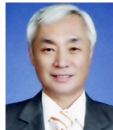
H.E. Edmundo Sussumu Fujita